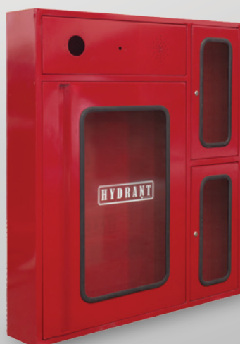
B combination w/ Side FE cabinet