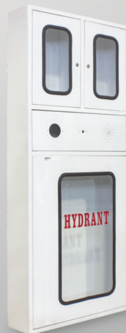
B combination w/ Top FE cabinet